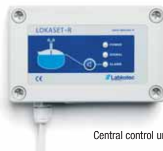
Central control unit